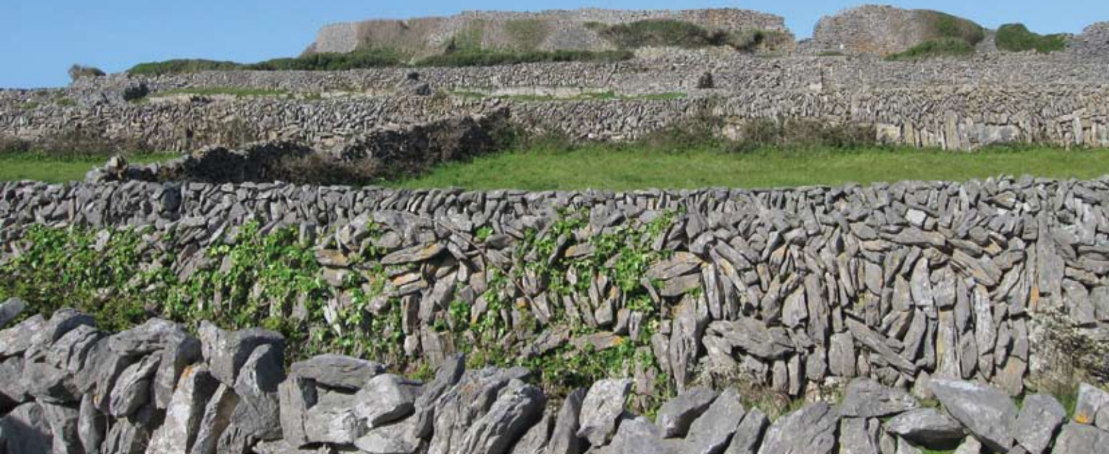
–View towards Dún Chonchuir, Inis Meáin over stone wall network ( E. Delaney )

A number of traditional farm practises associated with high nature value farming were considered to be in decline (such as potato and vegetable growing, stone wall building) or in danger of being lost (such as working Connemara ponies, rye production, using seaweed). This then can affect the nature to be found on the farmland, for instance, the practice of growing rye for thatching, which has encouraged the presence of rare plant species, is in decline, and so the associated rare plant species may be at risk.