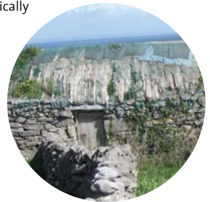
– Derelict cottage thatched with rye on Aran Islands. (E. Delaney)

High Nature Value farming is labour-intensive and economically marginal. Farmers' incomes depend on external supports, such as direct payments, REPS, and other schemes. Other challenges are connected to changes in the agricultural economy. Decreases in the price of farm produce and limited markets for many traditional products were cited as problematic. Off-farm income sources were an important part of most farm households in the case study areas. These factors indicate that high nature value farming is not currently self-sustaining.