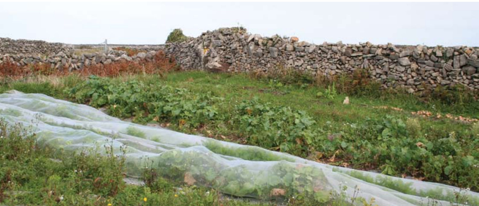
– Small scale vegetable cultivation on Inis Mór, a declining farm enterprise in Ireland (C. O'Brien)

As well as the undertaking of extensive background research on the heritage of the two case study areas, North Connemara and the Aran Islands, and agricultural and environmental policy, one of the most critical aspects of the project's focus was to involve the farmers themselves. Public consultation meetings were held in both case study areas at the beginning of the project; then further interviews were held with individual farmers to gather more detailed information on their farm enterprises, how farming practises are changing, the challenges they face in continuing to farm and in maintaining the landscape, and what they consider the solutions to be, and their opinions on whether designations and REPS are addressing these challenges. Field surveys of the natural and cultural heritage on their farms were also carried out and assessed.