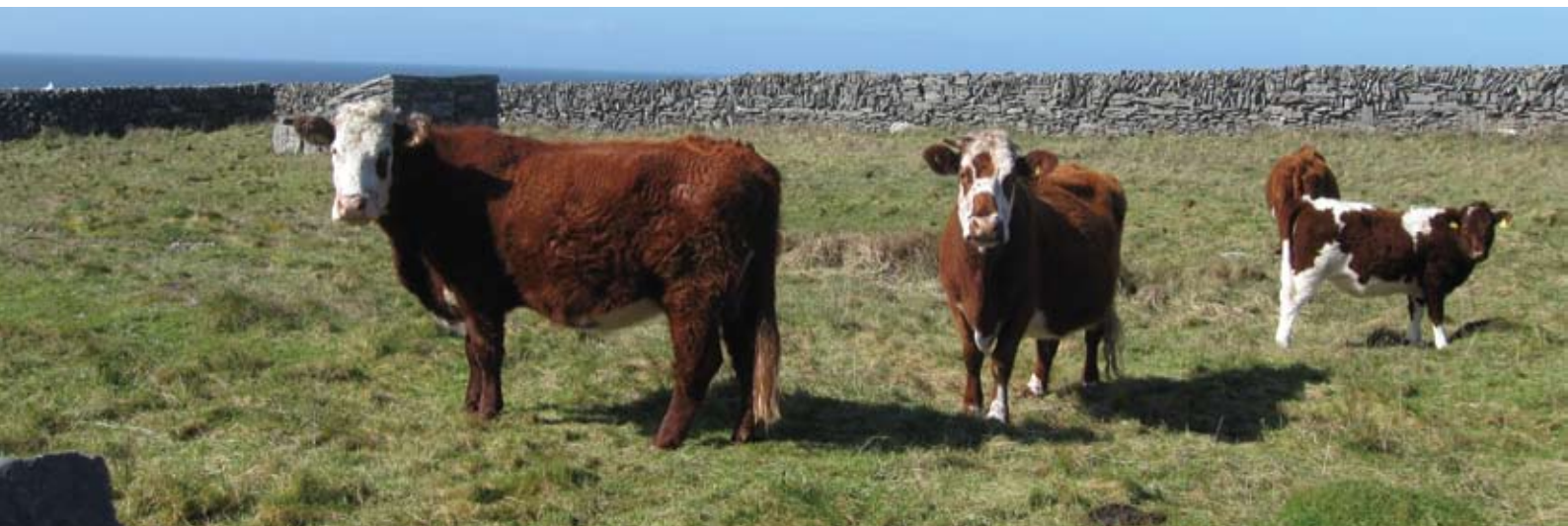
– Wintering cattle on Aran Islands ( E. Delaney )

"The main challenges to farming on the Aran Islands are the level of bureaucracy and the associated paperwork."