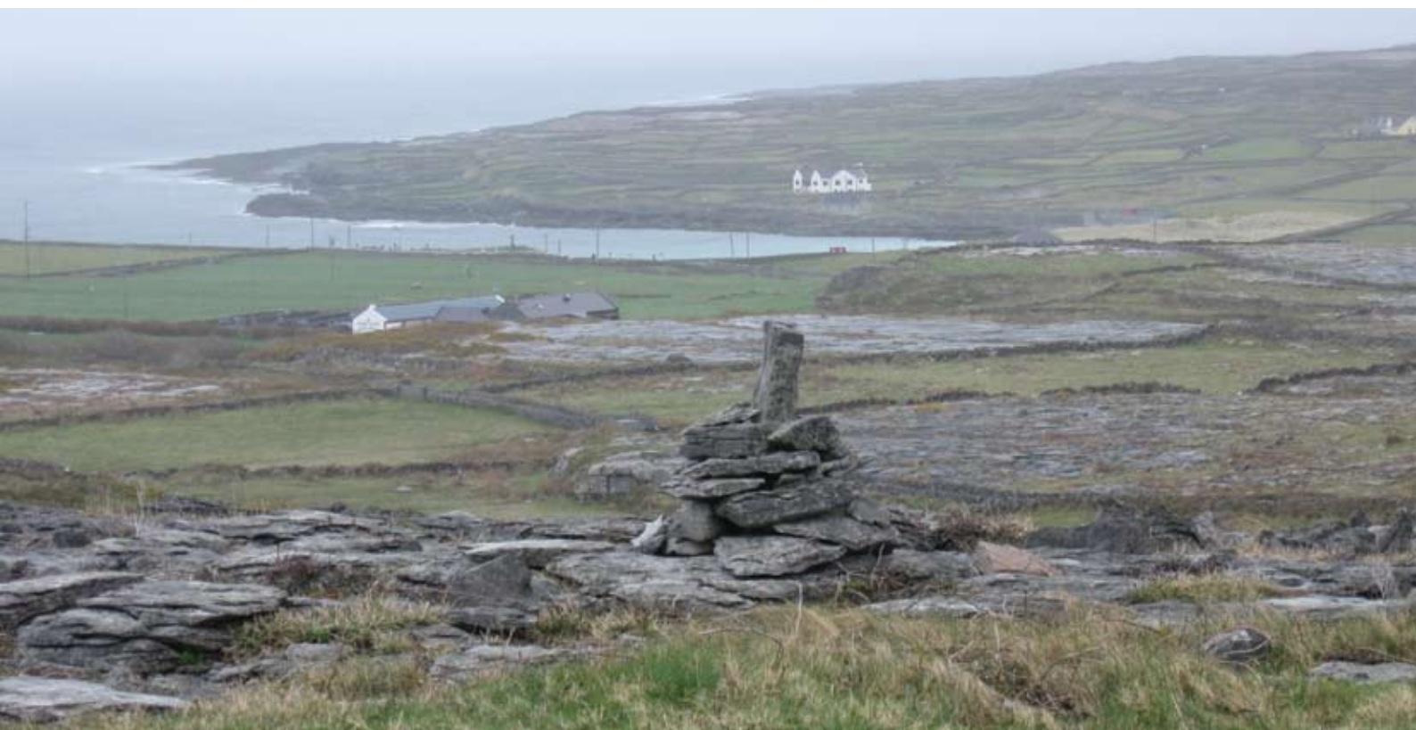
Inis Mór landscape in April 2009

All the farms surveyed were active farms and on these, scrub encroachment was not severe overall, although a number of stone walls were being encroached. However, many of the access boreens are becoming overgrown, and it was clear to the survey team that encroachment was an issue on other un-surveyed, potentially abandoned, farms, particularly on Inis Mór.